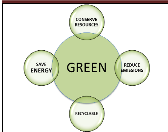
Fig.1: Role of Companies in Green Marketing

All major companies (such as PepsiCo), government agencies, and educational institutions (such as Duke) have expressed their commitment to buying green products for infrastructure and other processes [1, 5]. Many other companies are adopting Green Marketing; some of them are discussed below: