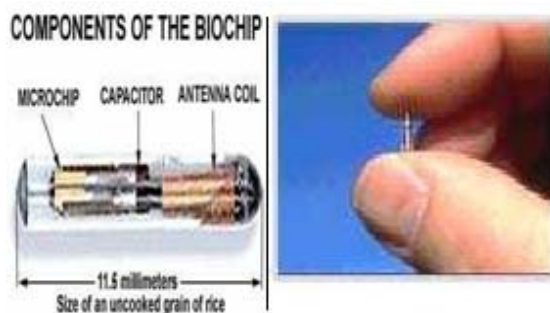
Perspective of the Actual Size

The current, in use, biochip implant system is actually a fairly simple device. Today's, biochip implant is basically a small (micro) computer chip, inserted under the skin, for identification purposes. The biochip system is radio frequency identification (RFID) system, using low-frequency radio signals to communicate between the biochip and reader. The Biochip Implant System Consists Of Two Components: