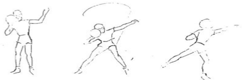
Fig. 3 Medicine Ball Test In Barrow Motor Ability Test

Test Item (3) Medicine Ball Put: This test measures primarily arm and shoulder girdle strength and secondarily power, agility, arm and shoulder girdle coordination, speed and balance.