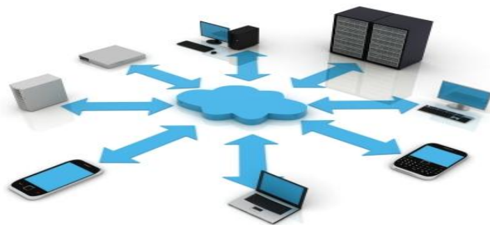
Figure1: Cloud Computing Environment

Architecture of cloud computing mainly comprises of four layers: Hardware, Infrastructure, Platform and Application. These four layers facilitate three different types of cloud services i.e. Software as a Service (SaaS), Platform as a Service (PaaS) and Infrastructure as a Service (IaaS). These layers are described in detail as follows