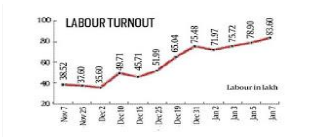
Chart 1. Labor Turnout due to Demonetization by MSMEs

The above chart depicts about the number of workers turnout after demonetization. Documents accessed under RTI reveal that MNREGA demand has spiked by 300% after demonetization indicating severe rural distress and fleeing of migrant workers (labour) back to villages seeking work after factories and MSME businesses. After a month of demonetization around 40% workers were went as jobless. It is quite clear from the above table that within two months around 84 lakhs workers are ruled out from the work because of this demonetization kind of surgical stroke.