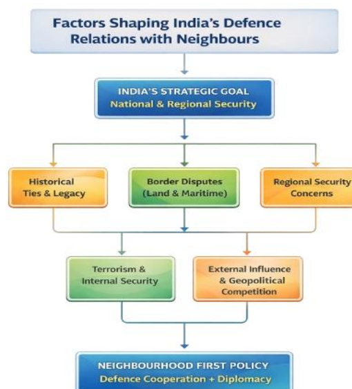
Figure 1: India's Strategic Goal: National and Regional Security

India is geopolitically sensitive in its neighbourhood as it shares borders with a number of countries both on land and on sea. The historical connections, the issues of borders, the concerns of security of the region and the new geopolitical rivalry define the defence relations with the neighbouring countries. India adheres to the principle of Neighbourhood First that focuses on intensifying cooperation in the face of the security threats of terrorism, border tensions, and foreign influence.