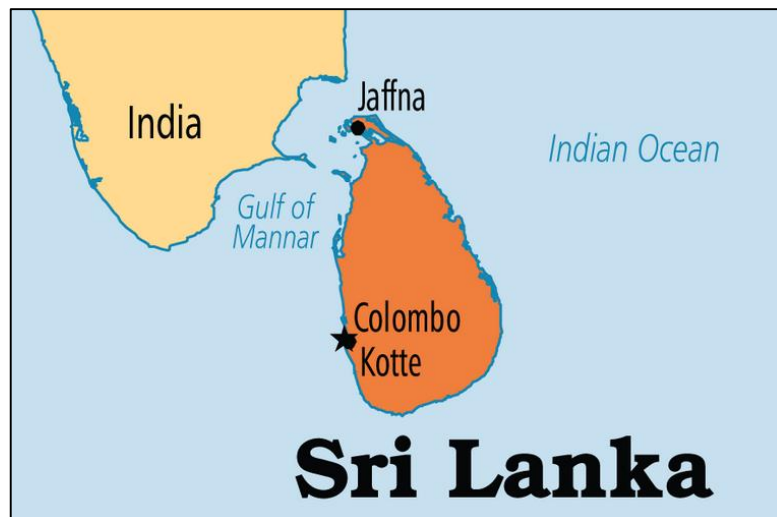
Figure 6: Geographical Location of Sri Lanka in the Indian Ocean Region

India’s defence relations with Sri Lanka are shaped by close geographical proximity, shared maritime boundaries, and overlapping security interests in the Indian Ocean Region (IOR). Sri Lanka’s location along major Sea Lines of Communication makes it strategically significant for India’s maritime security architecture. Defence cooperation focuses on naval coordination, maritime surveillance, training programmes, and humanitarian assistance, reflecting India’s emphasis on cooperative security in its southern neighbourhood (Kumar, 2022).