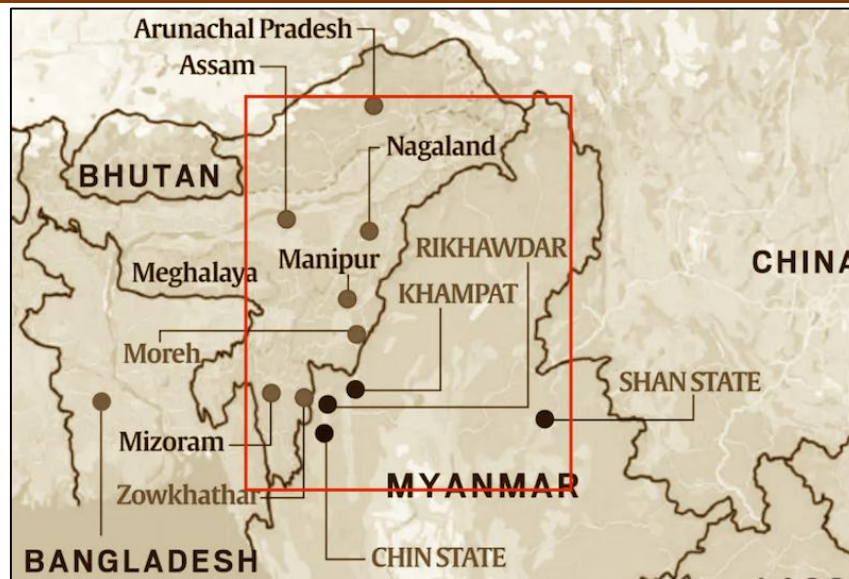
Figure 7: India–Myanmar Border Region and Security-Sensitive Areas

India and Myanmar engage in synchronised military exercises and combine patrols in order to reduce the insurgent movement across the border. Defence ties are further enhanced by training programmes, provision of non-lethal military supplies, as well as institutional military dialogue. Myanmar is a significant part of the Act East Policy of India as well, which is why security cooperation is necessary to protect the infrastructure and connectivity initiatives in the country (Mohan, 2023). India has had practical defence involvement with Myanmar even when the country is experiencing political instability in order to protect its own strategic as well as internal security interests.