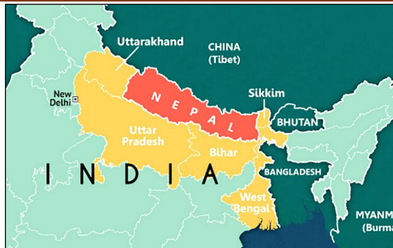
Figure 4: Geopolitical Map of India–Nepal–Bhutan–Bangladesh Region

Military training and capacity building are also important points in this connection. Institutional interoperability and linkages have been enhanced with Nepal Army officers and soldiers having been trained in various Indian military academies. Frequent combined military exercises, the best-known being Surya Kiran, boost operations coordination, disaster response and trust. India also provides defence aid, infrastructure, and humanitarian aid to Nepal during earthquakes, floods and other disasters, further asserting India as a quality security ally (Ministry of Defence, 2023). Mutual dependence in this context is reflected in the defence relationship, as political conflicts and boundary-related matters sometimes occur, though the defence relationship has not been very susceptible to the ups and downs in diplomatic relationships.