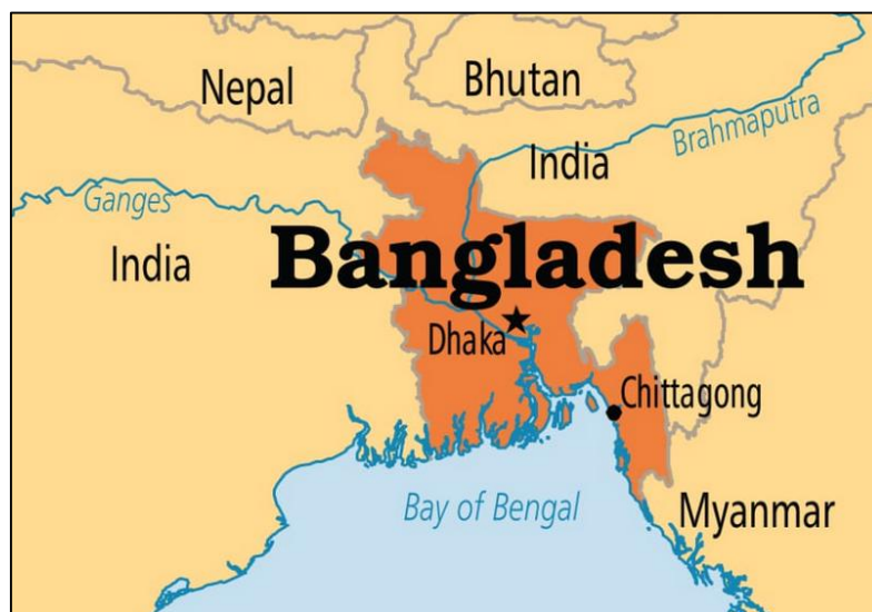
Figure 5 : Geographical Location of Bangladesh in South Asia

The collaborative milestones in one of the largest areas are the joint military exercises and training programmes. The Indian Army conducts regular bilateral drills with the Bangladesh Army called Sampriti aimed at counter-terrorism warfare, humanitarian aid, disaster management, and war preparedness. These drills increase operational interoperability, mutual trust, and coordination, especially in border areas and riverine terrain, which is a challenge to both security and logistics (Singh, 2023).