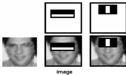
Fig 3. Haar Features